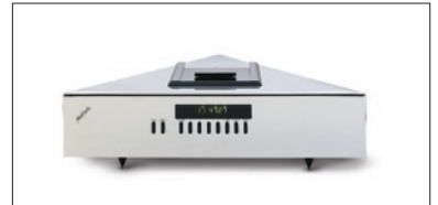
State of the art Compact disc player / transport CD I