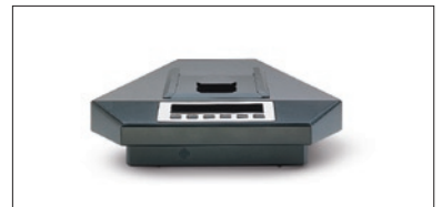
High end Compact disc player Space