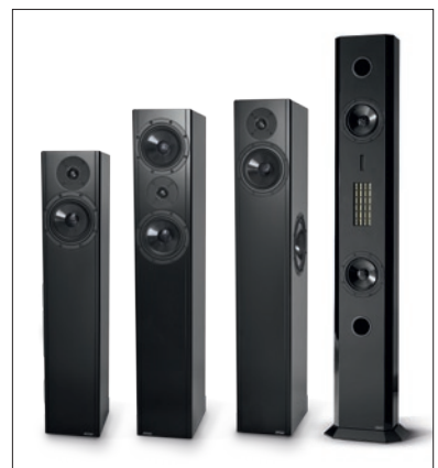
Studietta II, First II, First II Bipolar, Magnetic II